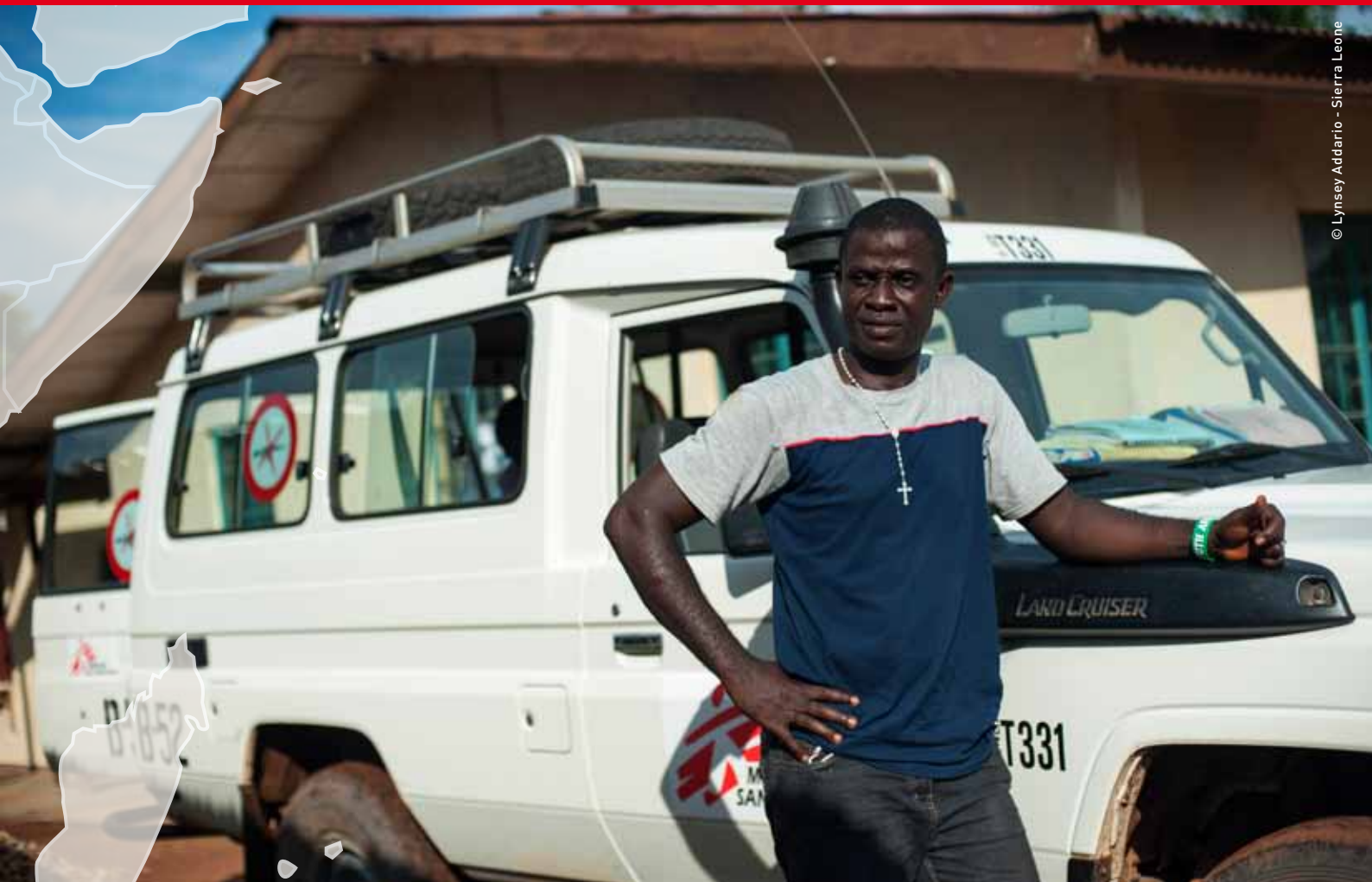
Sierra Leone

“ I’ve been working for one and a half years for MSF. Being an ambulance driver is a life-saving job. You have to use your energy and strength to do this work. If we have a patient who is in very critical condition, you have to rush to save that life. And the roads are very bad. Sometimes it’s two hours to get to where they are, and the patient is almost about to deliver. Two weeks ago we went to Jimi Gbagbo health centre. In the ambulance, the patient was shouting, oh mister driver, break! oh mister driver, break! She nearly pulled my shoulder for me to break because the road was so bumpy, and she was in pain. The moment we reached the hospital she almost delivered in the vehicle. ”