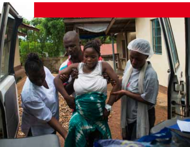
Sierra Leone

Based on existing data, it was estimated that in the absence of the MSF intervention, 7.5 - 13.2 percent of women with a SAMM would have died 4 . Using this to estimate the number of maternal deaths averted by the MSF intervention, the expected maternal mortality ratio in the respective districts was calculated.