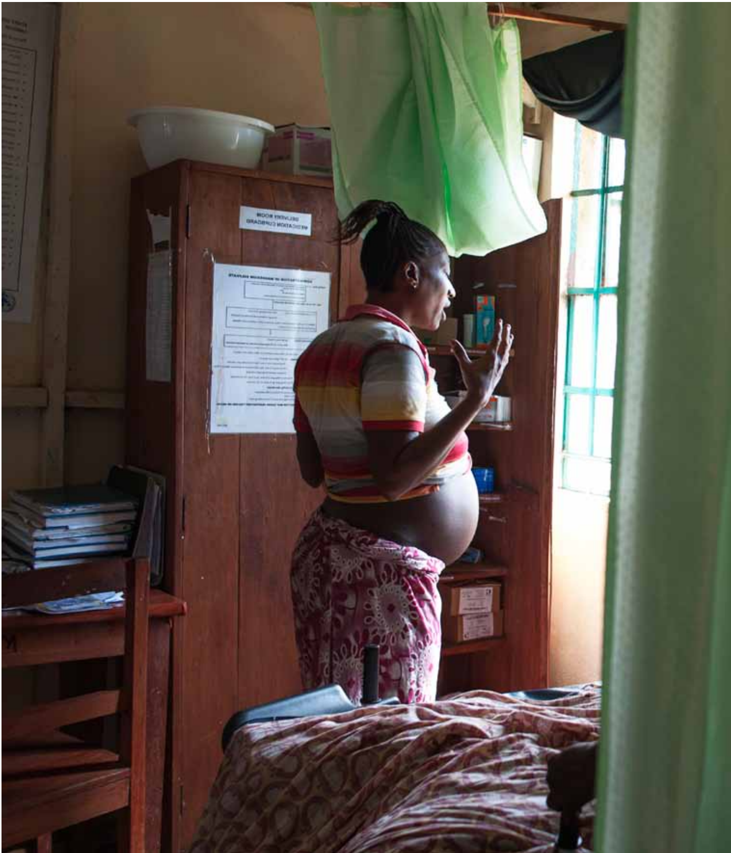
© Lynsey Addario - Sierra Leone